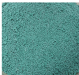
Figure 2: \text{CuSO}_4 on zeolithe