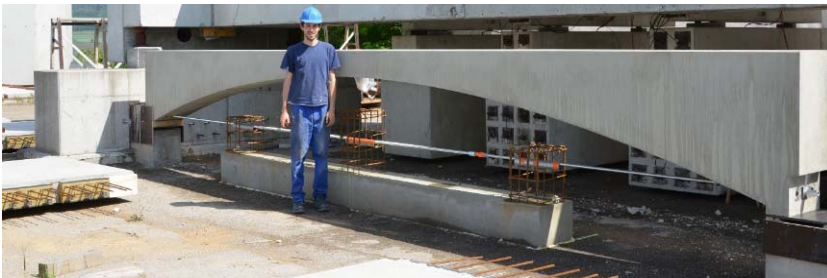
▼ Construction of a prototype to test the new technology

The new technology is suitable for the construction of integral road, railway and pedestrian bridges. It is especially beneficial when it comes to bridges built in wide, flat valleys.