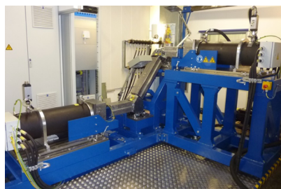
Universal test stand in power feedback configuration at TU Wien

A laboratory for aircraft systems is planned, providing the means for: