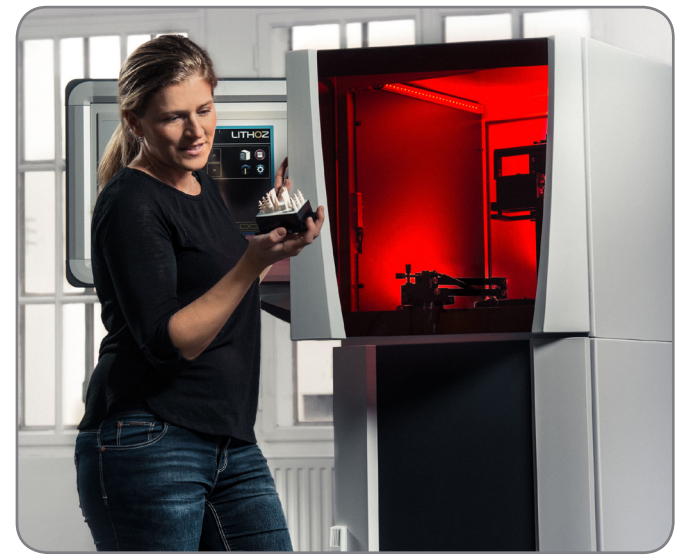
User friendly CeraFab 7500 3D printers for high performance ceramics

By increasing the degree of powder filling and optimising the slurry, the sintering shrinkage and debinding time can be considerably improved. TU Wien and Lithoz GmbH filed for several patents for this method.