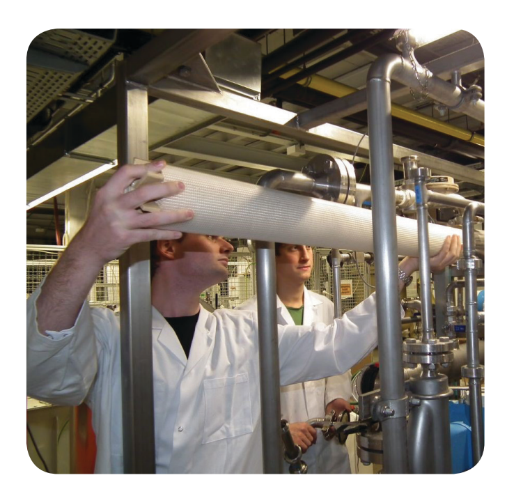
Three-stage pilot system (RO/NF/NF) with five 4" membrane modules

With intelligent recovery of the separated flows of recyclable materials into the upstream process steps, loss of valuable material is minimised. Water is only discharged in the reverse osmosis stage. As a result of the low process temperature – in comparison to the evaporation method – product quality increases. The number of stages can be adapted depending on the requirements for the concentration.